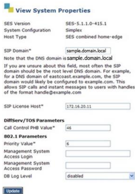
Figure 2: SIP Domain

IMPORTANT The authoritative domain name must be the same throughout the SES, Communication Manager, and MiCollab AM programming.