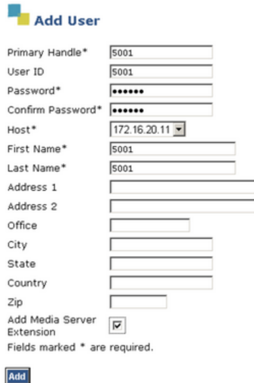
Figure 4: Add User

IMPORTANT After you have completed all changes find, and then click the Update link on the navigation menu at the left side of the Integrated Management page. You must click this link to save your changes.